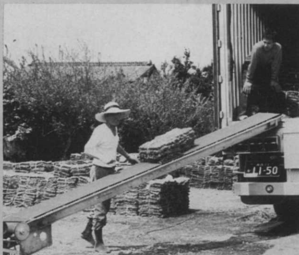
It often takes two years to produce a zoysiagrass sod crop, which is why it's an expensive commodity.