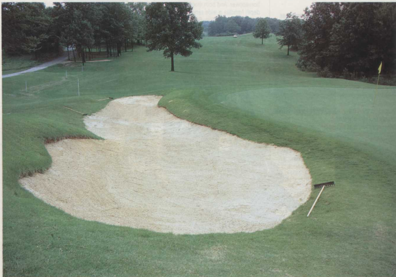
The slow growth and good root binding of zoysiagrass ensure enduring integrity around bunkers. Its golden winter color can be a striking sight on golf courses.

But dormant zoysia can handle some traffic without overseeding. The contrast of zoysia's natural winter color can be quite striking on a golf course fairway. Zoysiagrass is not as aggressive as Bermudagrass and is easier to keep trimmed around sand