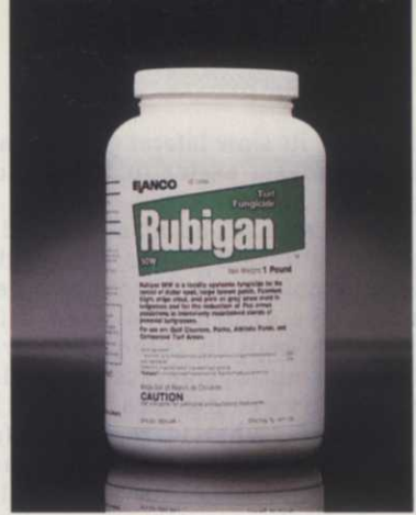
Circle No. 124 on Reader Inquiry Card