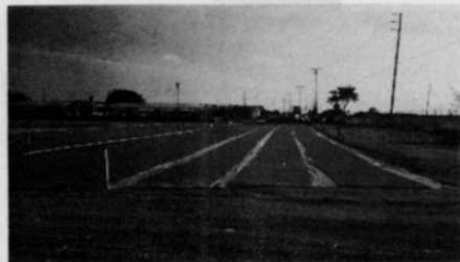
Fast Grass on its plastic liner after 22 days exhibits a good stand of turf.

In addition to the four-foot-wide roll, the carpet also comes in 12-foot-wide rolls. Possible spinoffs for the carpet include flower and vegetable seed worked into the fabric.