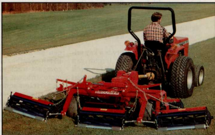
6. 3, 5 or 7 Gang Hyd. or Manual Lift P.T.O. Mowers