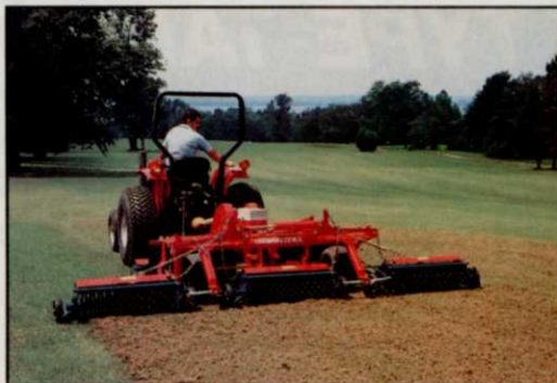
8. 5 Gang Vertical Mower