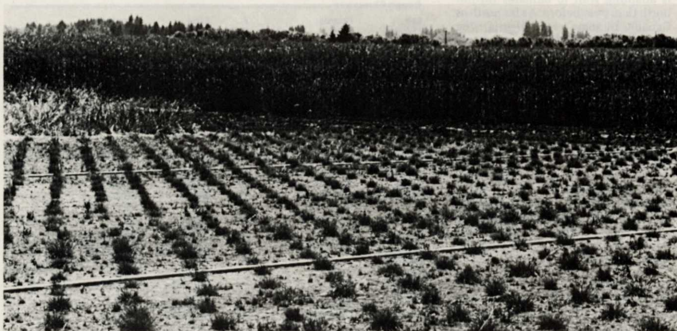
Distributors hope a surplus of bluegrass will help ease the problem of reduced acreage in the Willamette Valley, Washington and Idaho.