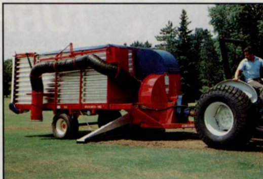
9. Large Capacity Brouwer-Vac™