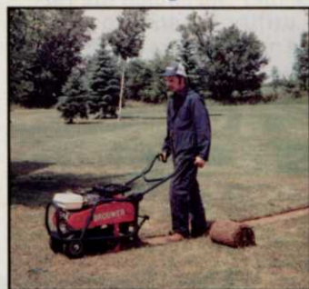
4. Sod Cutter MK.2™