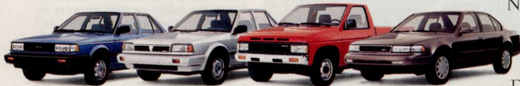
Just a few of the vehicles in the Nissan fleet lineup.

One will be at your service immediately.