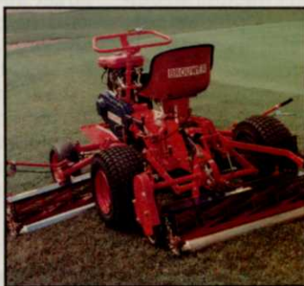
5. Triplex 376-A