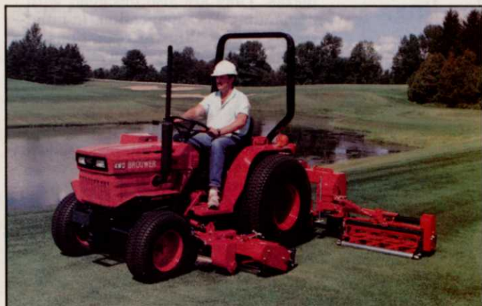
1. 3, 5 or 7 Gang Tractor Mount Mowers