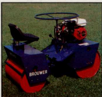
2. Turf Rollers 130, 224 & 235