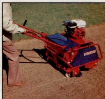
3. 24 in. Seeder/Over Seeder