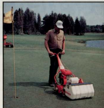
7. Brouwer Greens Mower