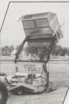
Model 166hl 5' width, 8 1/2' lift