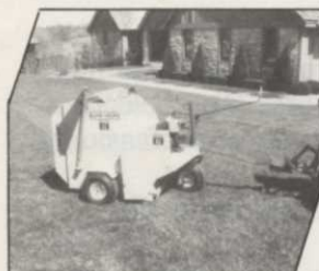
Model 42 tow — type, 1/3 cu. yd. 5 hp, 3' swath, finger or brush reels.