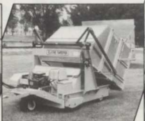
Model 166e 5' hydraulic ground dump