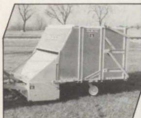
Model 65 PTO-powered 5' width

Olathe personnel have been helping solve leaf/debris problems for over 30 years. Ranging in size from our model 42 (36" wide, 5hp tow-behind) to the large area tow units which are the 166e, the 166hl and the 65 PTO (all with 5' width, 5 cu. yd. capacities). Ground and high lift models.