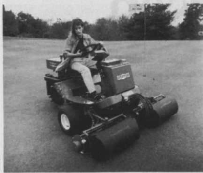
Circle No. 202 on Reader Inquiry Card