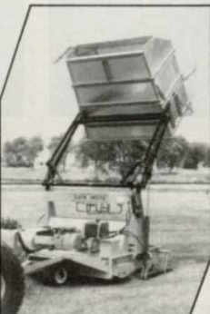
Model 166hl 5' width, 8 1/2' lift