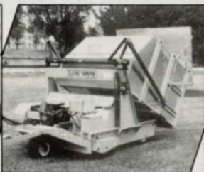
Model 166e 5' hydraulic ground dump