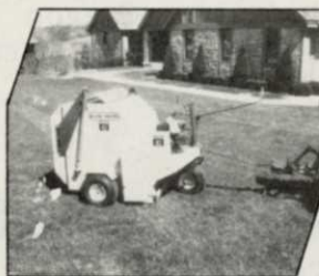
Model 42 tow — type. 1/3 cu. yd. 5 hp, 3' swath, finger or brush reels.