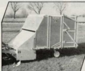
Model 65 PTO-powered 5' width

Olathe personnel have been helping solve leaf/debris problems for over 30 years. Ranging in size from our model 42 (36" wide, 5hp tow-behind) to the large area tow units which are the 166e, the 166hl and the 65 PTO (all with 5' width, 5 cu. yd. capacities). Ground and high lift models.