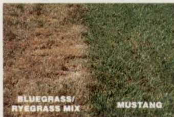
DROUGHT TOLERANCE AFTER SEVEN WEEKS NO RAINFALL.

Best of all, Mustang is practical, because it performs