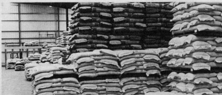
Jacklin's warehouse was stocked in June, but not with its own proprietaries. They were sold out. This year's crop faces the same fate.