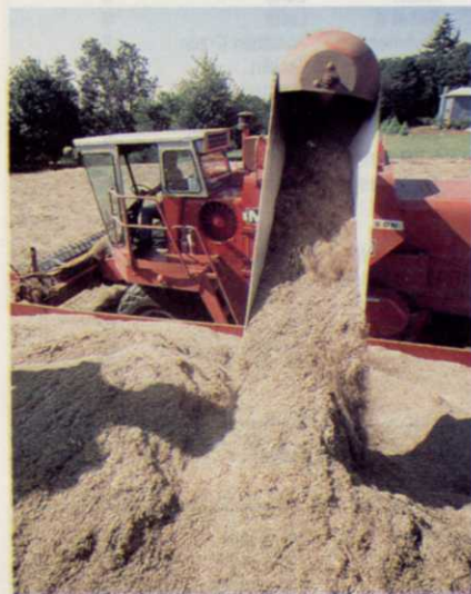
Fine fescue is loaded for transport to cleaning facilities.

The highly-rated Adelphi will be hard to come by this year. "Early visual reports seemed to indicate that