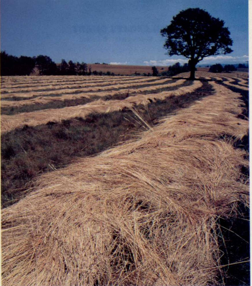
Seed remains on plants lying in windrows awaiting thrashing and transportation to cleaning facilities in Oregon.

What is causing this high demand? "The last six years, the economy has been on a roll," Stanley notes. "The