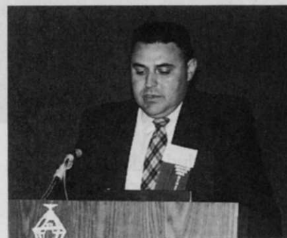
Lesco's Art Wick sees dwarf tall fescue as the next trend in turfgrass production.

Lesco's yields are down slightly as well. "It's not a surplus crop so prices