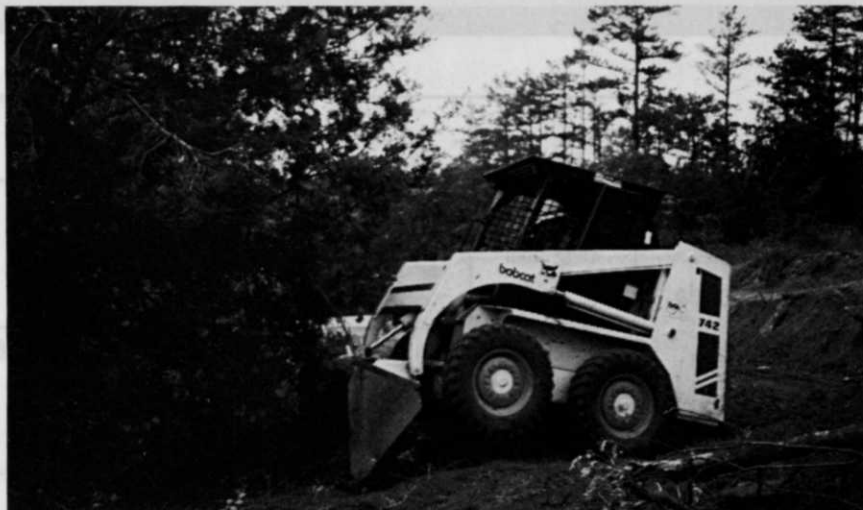
Skid-steer loaders maneuver well in small areas.