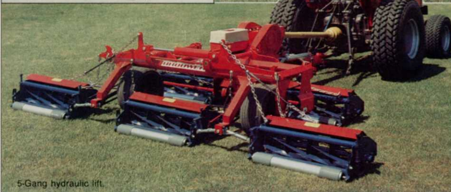
5-Gang hydraulic lift.