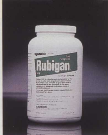
Circle No. 117 on Reader Inquiry Card

Elanco Products Company A Division of Eli Lilly and Company Lilly Corporate Center Dept. E-455, Indianapolis, IN 46285, U.S.A. Rubigan®—(fenarimol, Elanco Products Company) Daconil 2787®—(chlorothalonil, SDS Biotech Corporation)