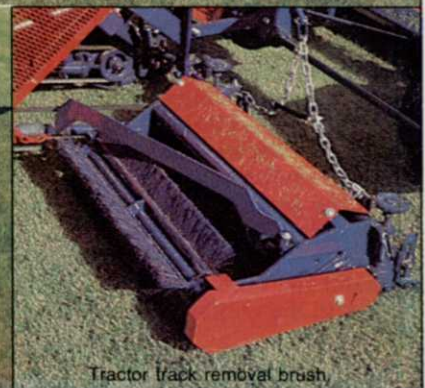
Tractor track removal brush.

Now with many new outstanding features . . . the Brouwer P.T.O. mowers are designed to produce the highest quality cut, no matter what the conditions, no matter the season. Wet grass, dry grass, short or heavy grass, Brouwer high capacity mowers can cut-it. Ruggedly built from quality materials the 5 or 7 gang units promise season after season of economical reliable service with outstanding performance, less horsepower requirements, less tractor fuel consumption and less compaction. Check the option packages that include Tractor Track Removal Brush; Quick Height of Cut Adjuster; Backlapper; Ball Hitch; Highway Tires and many more that allow you to customize a mower to suit your particular conditions and requirements. Also available are the Fairway Models with floating heads and front rollers for a perfect short cut on undulating fairways.