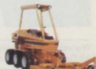
Model 602D 32 hp, 72" hillside