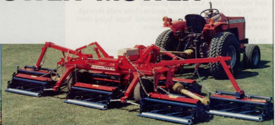
7-Gang hydraulic lift.