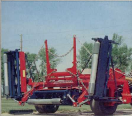
High ground clearance for easy transport.