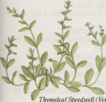
Thymeleaf Speedwell (Veronica)