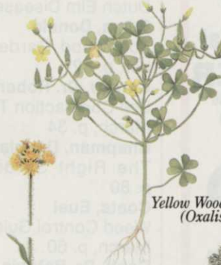
Yellow Woodsorrel (Oxalis)