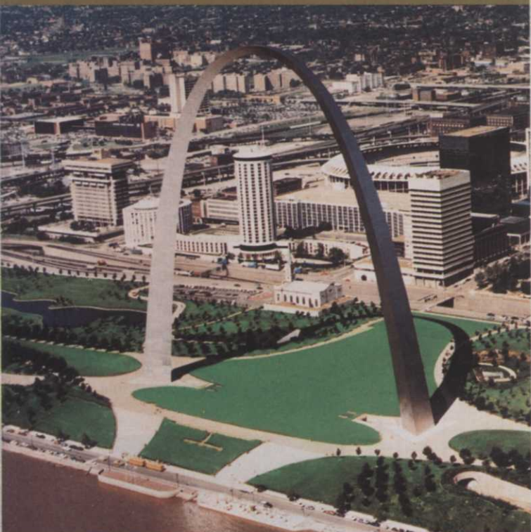
THE GATEWAY ARCH • ST. LOUIS, MISSOURI