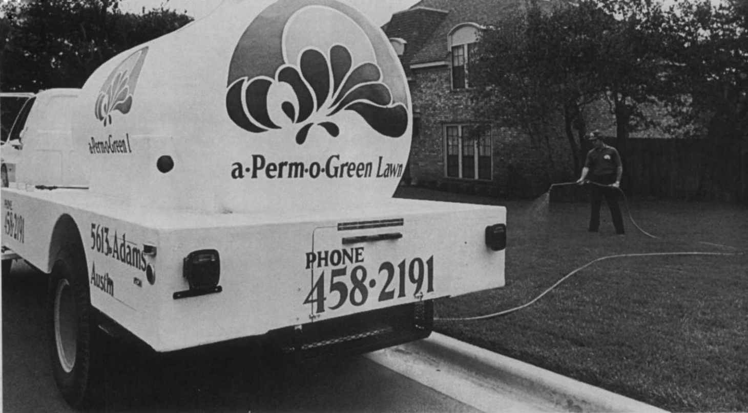
An a-Perm-o-Green employee uses a hand-held nozzle to spray a home lawn in Austin, Texas.