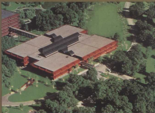
DEERE & COMPANY CORPORATE HEADQUARTERS • MOLINE, ILLINOIS