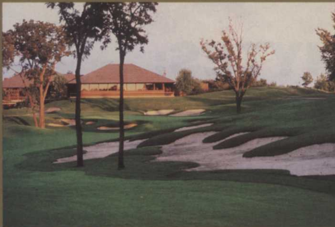
MUIRFIELD VILLAGE GOLF CLUB • DUBLIN, OHIO