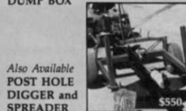
$550 LOG SPLITTER

Also Available POST HOLE DIGGER and SPREADER