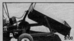
$700 DUMP BOX

The Dakota Hand is made specifically for resorts, golf courses, apartment complexes, hobby farms, parks, nurseries, municipal and state facilities, and for rentals, landscapers or soil conservation.