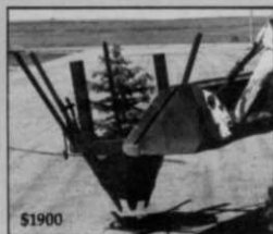
$1900 BUCKET or 3-POINT MOUNT TRANSPLANTER