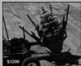
$3200 TOWABLE TRANSPLANTER