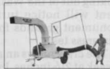
TORNADO TRUCK LOADER Super vacuum powered by 30 hp engine. Scoop or pick-up hose.