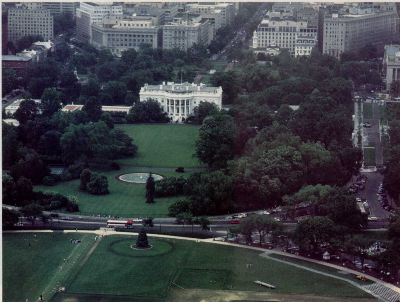
The view out the window of the Washington Monument shows the White House and land managed by the National Park Service.