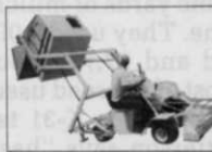
MODEL 70-LD Sweeps 54" wide. Self-propelled. 2 cu. yd. ground dump hopper.