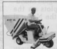
MODEL 80 Sweeps 48" wide. 3 wheels for short turning radius.