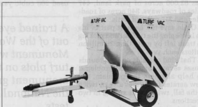
MODEL FM6 PTO. Fast, powerful sweeper tows behind PTO tractor. Vacuums up bottles, pine cones, heavy thatch. Sweeps 60" wide. Hopper capacity 5 cu. yds. unmulched material. Ground dumps.

15701 Graham Street, Huntington Beach, CA 92649 Telephone: (714) 898-9382