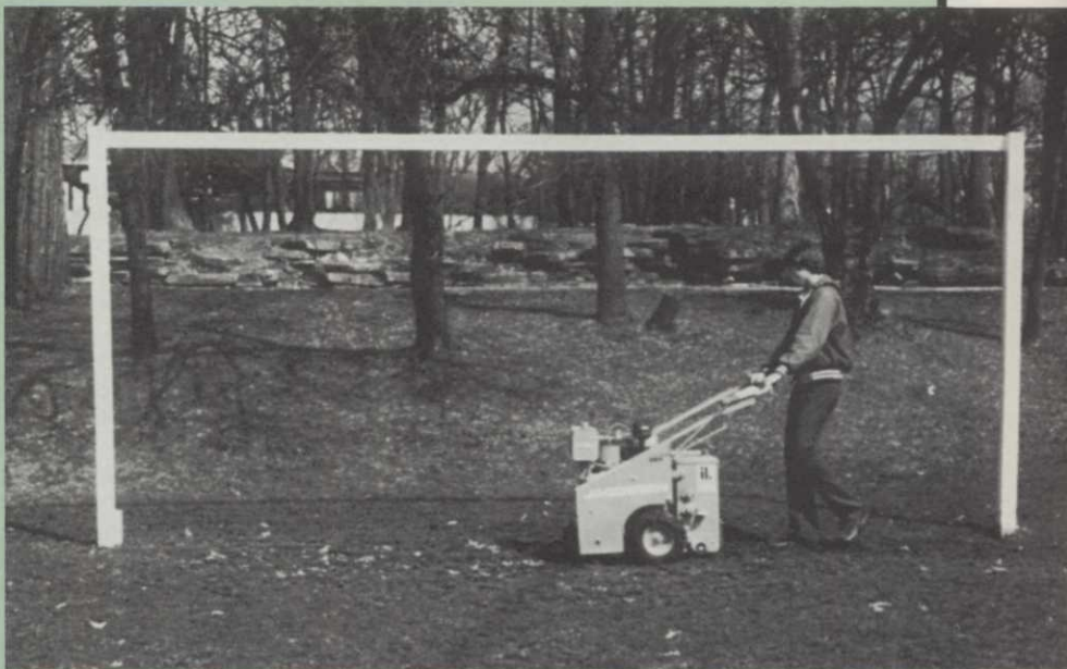
Slitseeding can help revive worn areas on athletic fields.

By the time the summer stress period approaches, the plant will have a developed root system, which requires less water and is prepared to face the heat and drought. An old diseased or insect-riddled turf area now takes on new