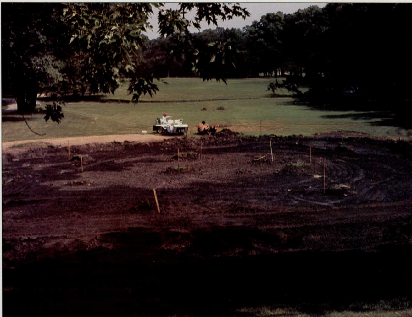
Crews prepare the 12th green on the North course for reseeding. Every green on the North course was renovated.