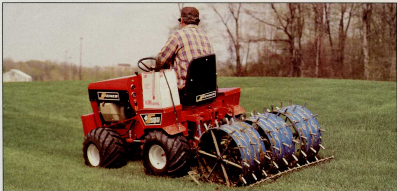
Drum-type aerators use the weight of a heavy tractor for good penetration. They will aerate a large area quickly.

I n turfgrass management, the answers aren't always easy. Turfgrass managers may turn to the spray gun or spreader, but still not solve the problem.