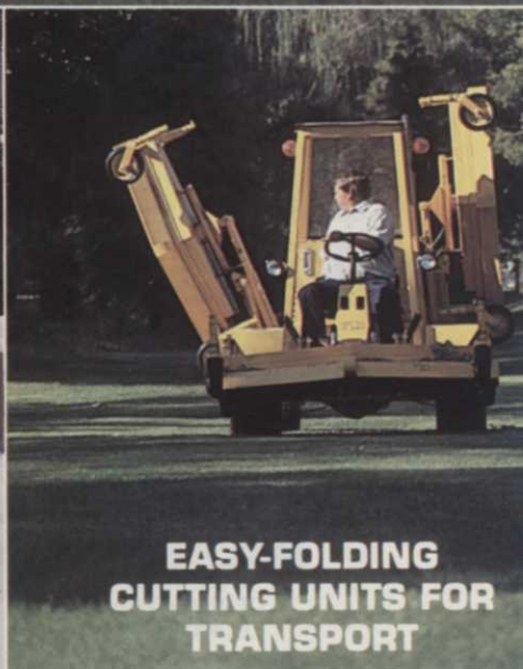
EASY-FOLDING CUTTING UNITS FOR TRANSPORT

Your search for a high capacity mower encompassing a one man operation is now concluded. The Hydro-Power 180 with its 15 foot hydraulically driven rotary mower has a mowing capacity of up to 11 acres an hour while incorporating rear wheel steering for maximum maneuverability. Cutting units are designed for maximum floatation and may be used individually or in any combination of the three.