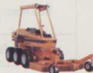
Model 602D 32 hp, 72" hillside