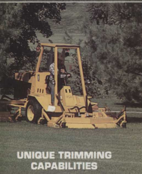
UNIQUE TRIMMING CAPABILITIES