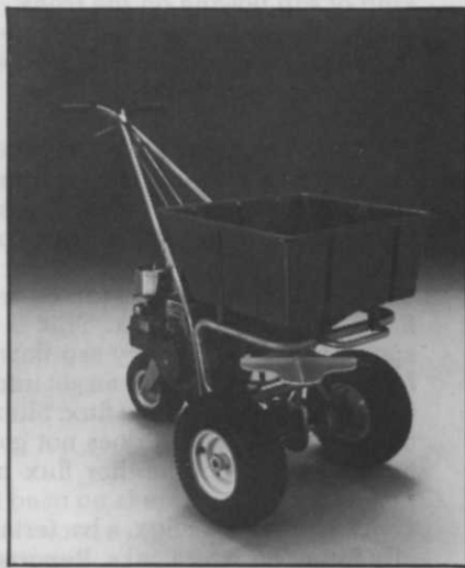
Circle No. 191 on Reader Inquiry Card

Commercial engine. A hopper cover to protect the product and allow transportation without spillage is available as an option.