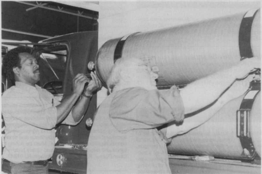
Tanks for storing natural gas are installed as a part of the conversion to dual fuel operation by participants in a seminar on natural gas conversion at Hocking Technical College in Nelsonville, Ohio.

residential areas and the engine is left running while the spraying is being done," he says. "Natural gas is clean burning and will emit far less pollutants in the air."