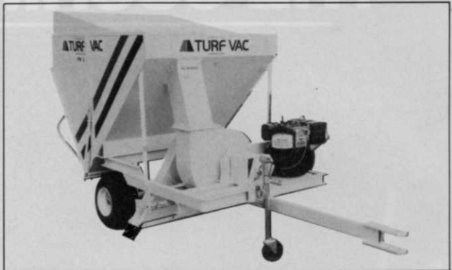
MODEL FM-3. With 4 ft. sweeping width and 11 HP B&S engine. Ideal for landscaping maintenance and other general purpose sweeping.

Write for brochures/distributor in your area.