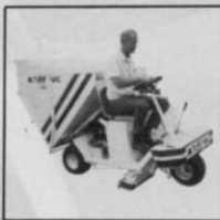
MODEL 80 Sweeps 48" wide

P.O. Box 90129, Long Beach, CA 90809 Telephone: (213) 426-9376