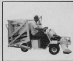
MODEL 70 LD Sweeps 54" wide