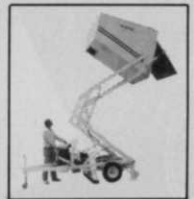
MODEL FM-5 Lifts to Dump 96"