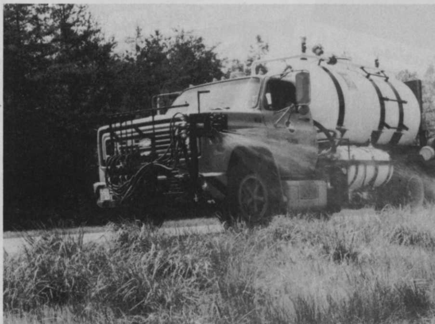
The Virginia Department of Highways and Transportation was conducting comparison applications of two new Du Pont herbicides, Telar and Escort, when this photo was taken.

large trees by pushing or pulling the plants out with as much of the roots intact as possible. Special attachments to the straight blade include teeth or U-shaped "stingers" to allow cutting the plant off below the ground line and lifting out the roots.