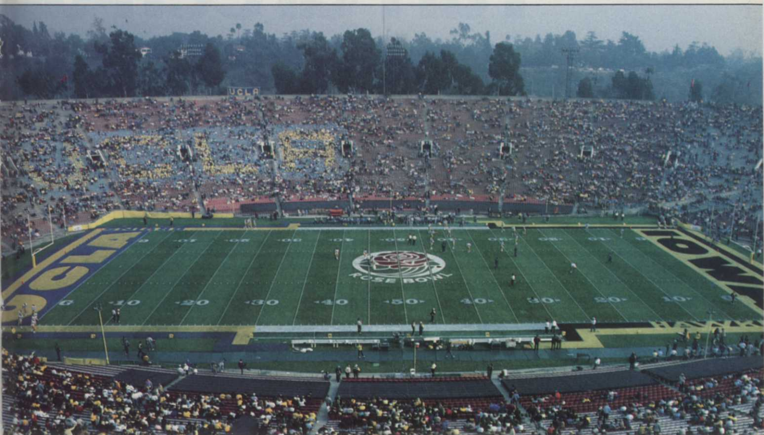
The Rose Bowl at Pasadena, CA, January 1, 1986

New generation perennial ryegrasses provide 'near perfect' playing surface . . . prove older ryegrass varieties to be passé