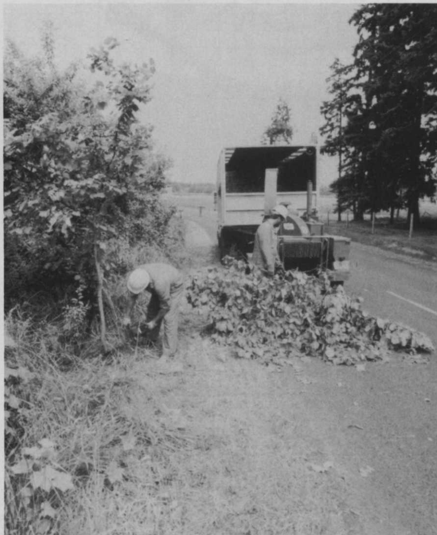
Workmen clear brush from right-of-way area.