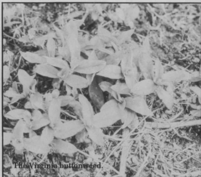
The Virginia buttonweed.