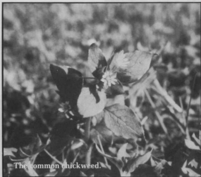
The common chickweed.

Editor's note: Throughout the sections of the Weed Control Guide, there are references to herbicides that the authors say have been shown to be effective in combating a certain weed problem. The herbicides labelled as effective are not endorsed by WEEDS TREES & TURF. They have been shown to be effective in research experiments.