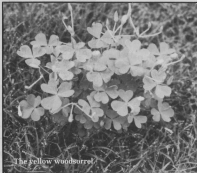
The yellow woodsorrel.