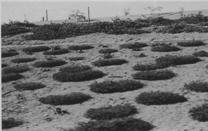
Arizona highway landscapers use a variety of low-water requirement desert plants and decomposed granite to beautify roadway and suppress erosion.

labor pool and the proximity of Arizona State University's college of engineering hasn't exactly hurt the industrial influx.