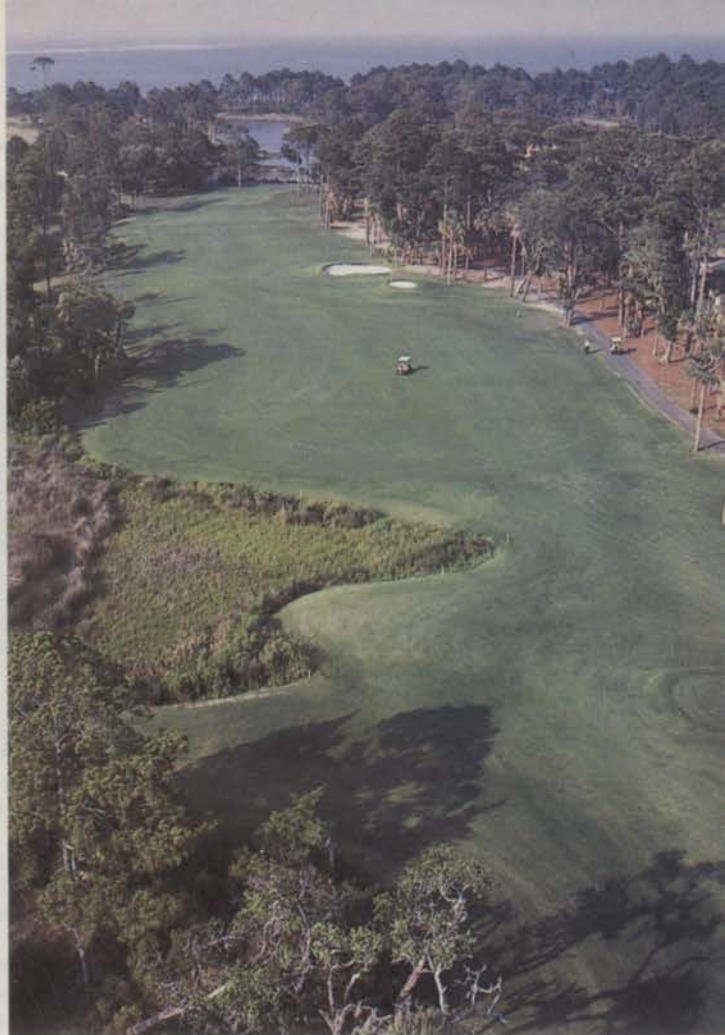
Wild Dunes, Charleston, South Carolina.