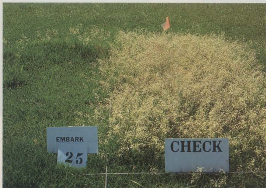
Vegetative and seedhead suppression of Kentucky bluegrass with Embark (left) compared to an unmowed check (right).