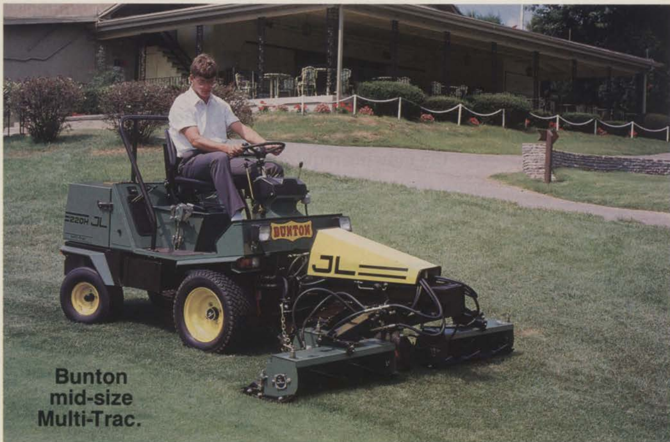
Buntun mid-size Multi-Trac.

One small step down in size. One giant step down in cost.