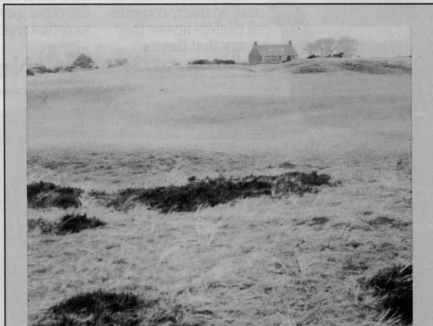
Today's golfer still finds challenge on these ancient seaside links at St. Andrews.

The ghosts of golf's rich heritage surround this genial Scot. It's a safe bet they're smiling at the way he keeps their memories alive for today's player. WT&T