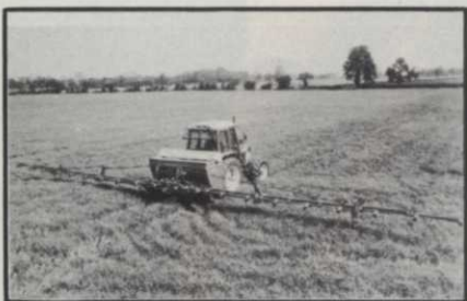
Circle No. 204 on Reader Inquiry Card

The spreader has a 286-gallon capacity hooper which holds more than a ton of granular fertilizer. The machine also spreads microgranular chemicals and seeds.