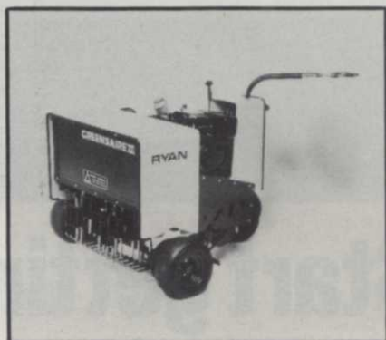
Circle No. 200 on Reader Service Card

The self-propelled Greensaire II can cover up to 6,900 sq. feet per hour with a 24-inch swath and two-inch coring pattern that removes 36 cores per square foot.