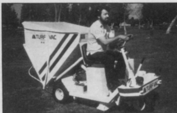
Riding Model 80

Only sweeper for both turf and pavement. Grass, glass and trash... wet or dry. Sweeping widths from 4 to 10 ft. Self-propelled and tow-type, both with ground dump and power lift dump.