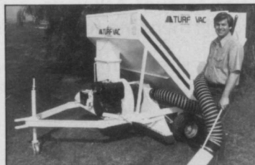
Model FM-5 with hand intake hose