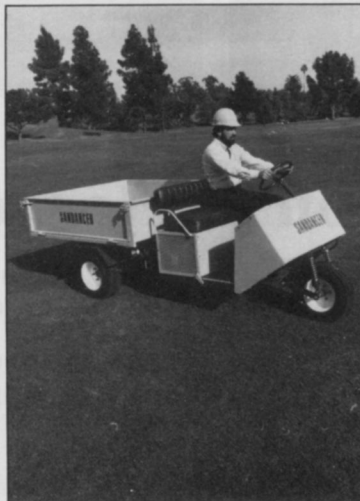
3 or 4 wheel models

Versatile multi-purpose work vehicle. Hill-climbing 18 h.p. gas engine with a unique power train that eliminates stripped gears and burned-out clutches. Three models and a wide selection of options allow you to build a SANDANCER to match your work needs.