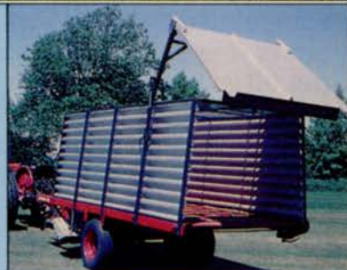
Self unloading with Hydraulic Door

The new Brouwer-Vac can be the answer to your clean-up problems. Designed to easily and economically pick up thatch from verti-cutting, grass clippings on sod farms, parks and golf courses. It has also proven very efficient when used to pick up leaves, twigs, paper, food con-