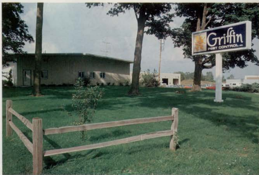
Griffin headquarters in Kalamazoo, one of three Griffin offices.

Griffin Lawn Care progressed from nursery school to graduate school in a period of months. Branch offices are now located in Battle Creek and