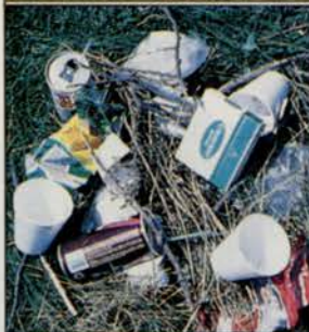
Also picks up debris & litter