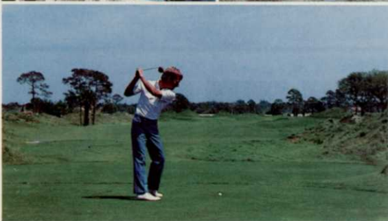
April 1984 - pumps installed; June 1984 - grassing and irrigation begins; October 1984 - greens and fairways take shape; December 1984 - course playable.

From sugar sand to playable course in six months through one of Florida's driest seasons... Sta-Rite pumps met the challenge! “The grassing of the new Loxahatchee Club in Jupiter started in June, 1984, and for the first month, we ran our three Sta-Rite submersible turbines 24 hours a day,” says Etchells. “That’s nearly 2,500,000 gallons of water daily. Then, for the next 90 days, they were slowly brought down to normal watering cycles of 600,000 to 900,000 gallons daily.”