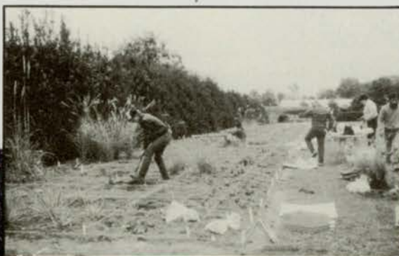
Perennial bed at planting (left) one year later (below). Students do most of the planting and maintenance.

The university provided Raulston with eight acres of land, part of the existing research farm, and tool support—, no