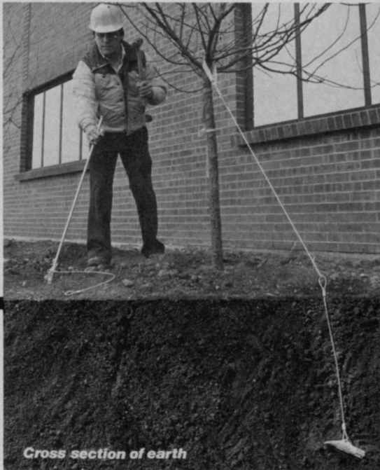
Cross section of earth