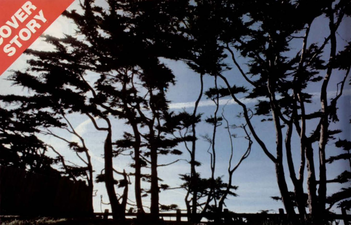
Pacifica, Calif., provides a beautiful setting for Monterey cypress recently thinned and shaped.