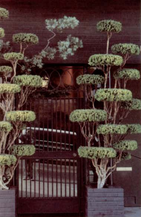
Niwaki trained Golden Arbor Vitae frame a San Francisco doorway.

Just as gardeners always overplant, we always underestimate foliar density when the trees are leafless."