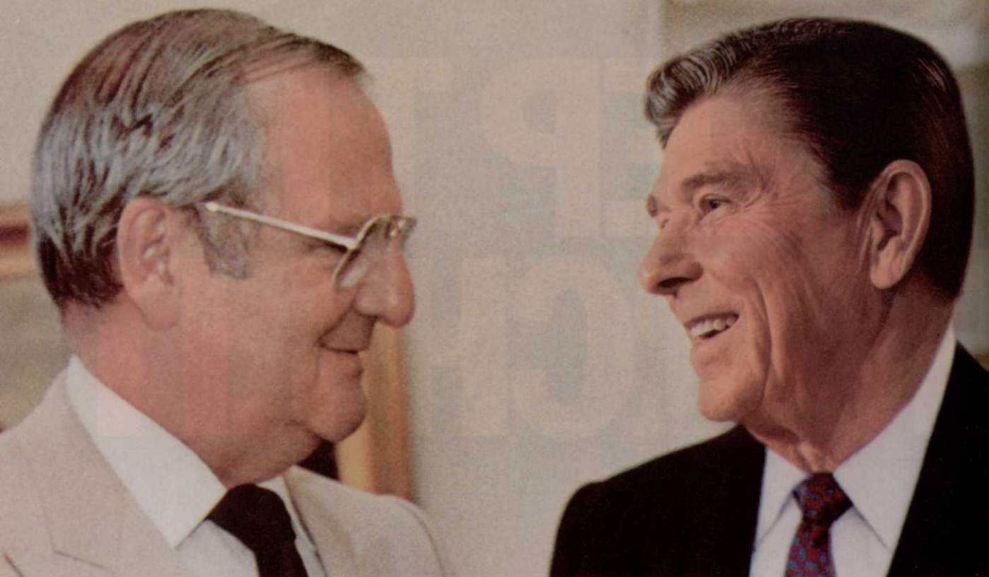
On May 18, 1982, President Ronald Reagan announced the formation of the Statue of Liberty-Ellis Island Centennial Commission and appointed Lee A. Iacocca chairman of the 20-member unit.