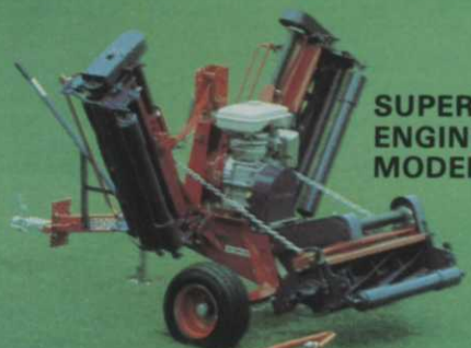
SUPER-3 ENGINE MODEL