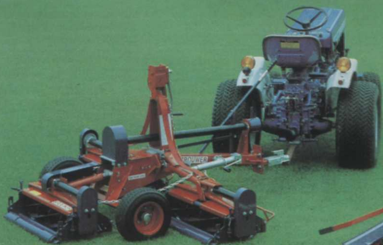
SUPER-3 P.T.O. MODEL