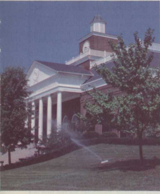
The College Football Hall of Fame, Kings Island, OH.

When officials from the National Football Foundation and Hall of Fame, Inc., owners of the field, went looking for answers they didn't have far to go. Spinney Field, the PAT prac-