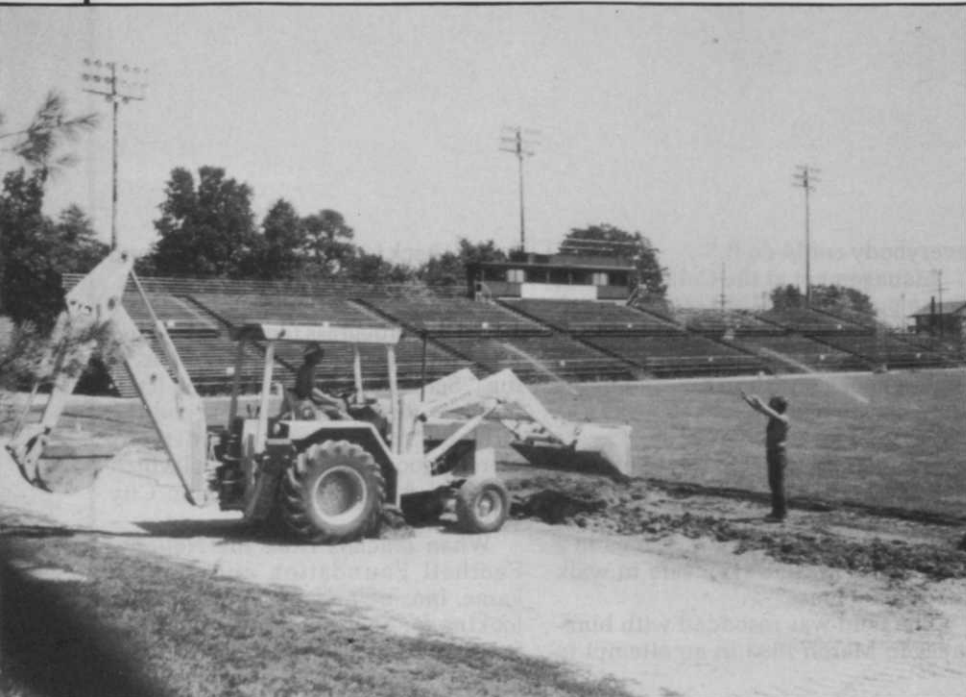
Filling in around irrigation lines at Galbreath Field, King's Island.