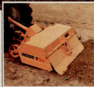
Woods Model T50 Rotary Tiller works a 50" swath.

Put the Woods Model T42 to work for you and your customers. Send for complete specifications today.