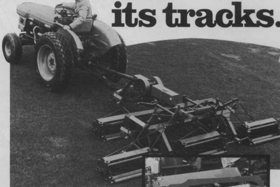
Tractor Track Remover brushes up grass behind tractor wheels.

For the landscaper, the small turf farmer, the Brouwer 5 gang PTO mower is a good cut above the competition. Change to more economical mowing, write for a complete brochure now.