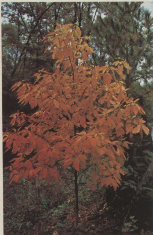
Sassafras exhibits scarlet-yellow fall color and has three distinctly different leaves. Transplanting is difficult due to a tap root.