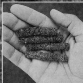
Removes uniform cores up to 3" long