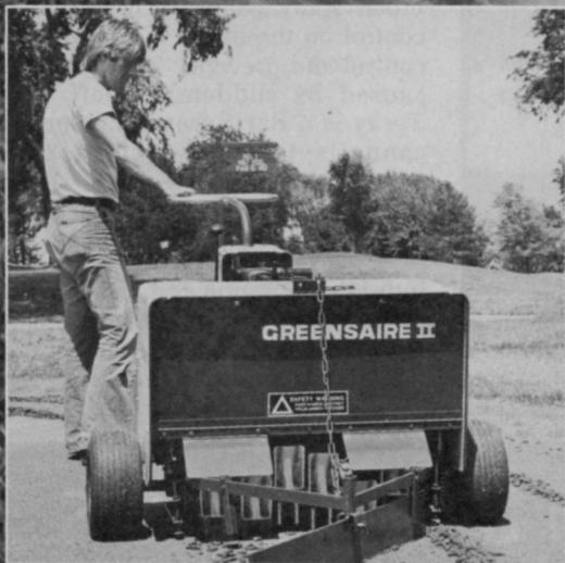
Shown with optional windrow.