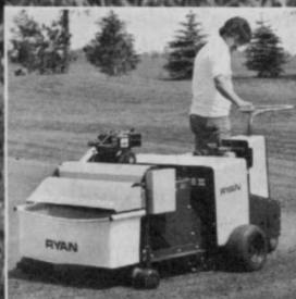
Shown with optional core processor.