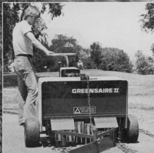
Shown with optional windrow.