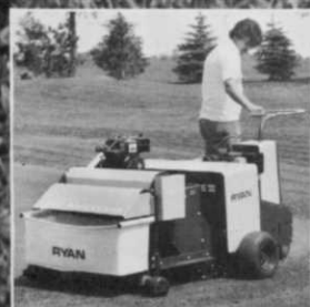
Shown with optional core processor.