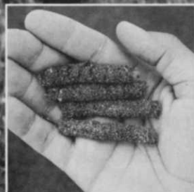
Removes uniform cores up to 3" long.