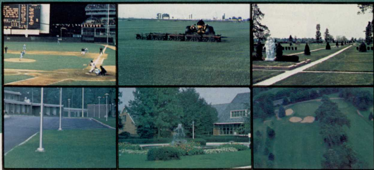
Ball Parks, Golf Courses, Sod Farms, Schools, Parks, Cemeteries, etc.

ADELPHI customers are happy with its dark green color . . . its thick fine texture and its excellent resistance to drought, heat and cold. Also, it is completely free of noxious weeds.