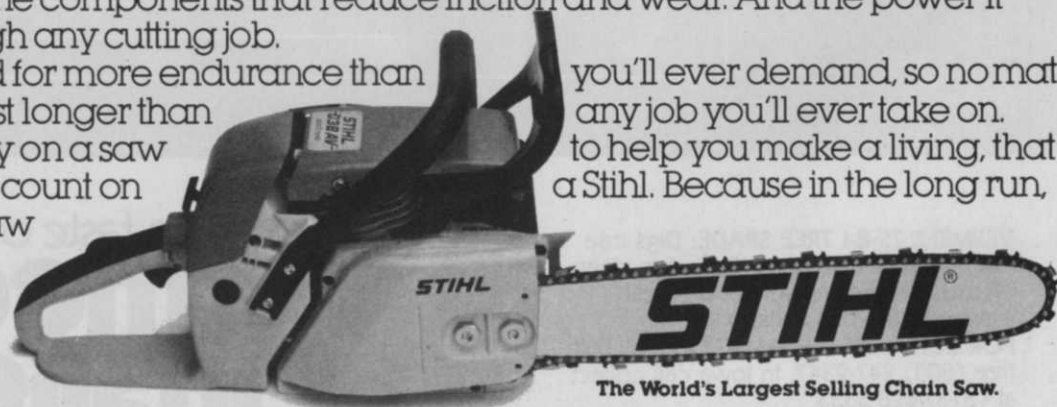
The World's Largest Selling Chain Saw.

you'll ever demand, so no mat- any job you'll ever take on, to help you make a living, that a Stihl. Because in the long run,