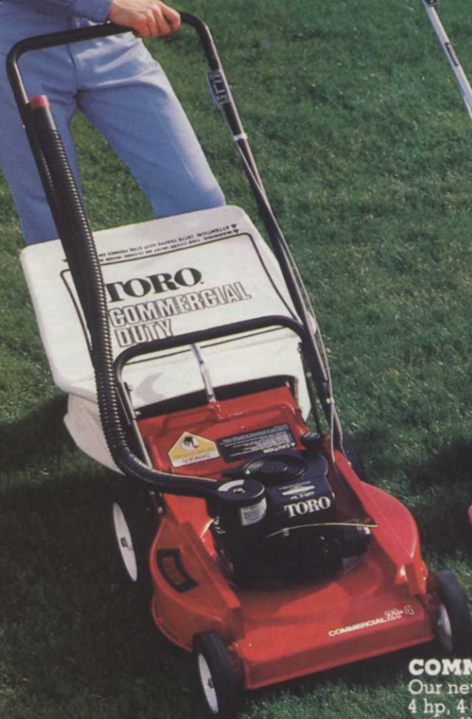
COMMERCIAL 21-4 Our new rear bagger, 4 hp, 4 cycle, hand- propelled mower.

Had it with walk mowers that break down before they're broken-in?