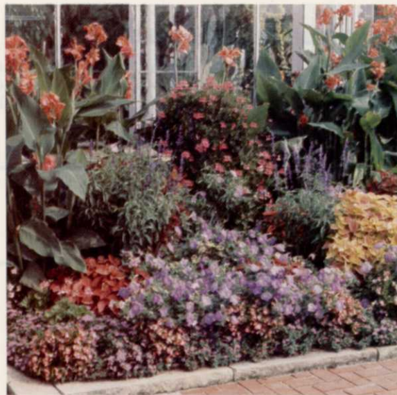
Mixed border near the entrance to the Agricultural Technical Institute in Wooster, OH, shows salmon cannas, mixed coleus, blue salvia, blue petunias, salmon geraniums, and ageratum. Mixed plantings can add interest to building entrances where viewers can see the plant material at close range.

Any conclusions reached should be viewed in the light of the particular growing season. If the latter part of summer has been unusually wet, it is not uncommon to witness poor performance of geraniums and petunias. Frequent rains spoil the