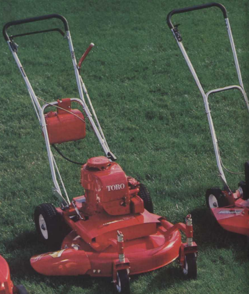
COMMERCIAL 25-6 Our high capacity, 6 hp, 4 cycle, self- propelled mower.

For light to medium size jobs, there's our new Commercial 21-4 side discharge mower.