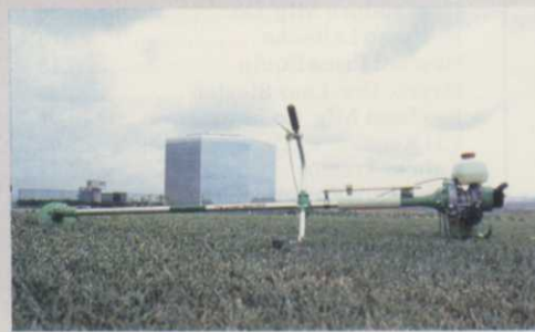
MODEL 4000 The high-production trimmer, brush cutter.