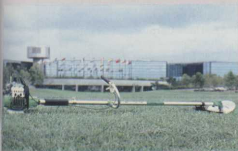
MODEL 3000SS The Pro's Choice.

Commercial-quality TFC™ Tap-For-Cord head equipped with Green Line extra long-life nylon string. (Model 3000SS, as well as 2500, 4000, and 4500, also accept metal blades for brush cutting and tree pruning.)