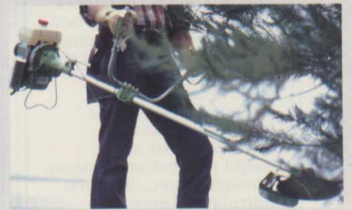
MODEL 4500 The Green Machine Forestry unit.

This Green Machine has set the standard for commercial-quality trimmers. Thousands are in use by professional gardeners, grounds maintenance crews, and large-acreage owners. The 3000SS has been made even better with a new, more powerful engine and solid-state ignition. Like the 2500, these units can also be used for brush cutting and tree pruning, using the accessory metal blades. Model 3000SS comes equipped with the commercial quality TFC™ Tap-For-Cord string trimmer head—the first automatic-feed head built for the professional. Other heads available include the ultra-simple, 2-string (.105) manual head designed specifically for rental-yard and other special uses. Quality features include: solid, heat-treated drive-shaft and spiral-bevel gears; anti-vibration clutch housing with dual bearings; larger, quieter muffler and air cleaner; larger gas tank.