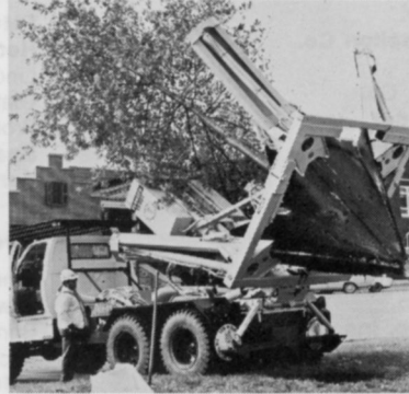
TS-66T: Ball diameter, 66 in.; ball depth, 48 in.; Maximum tree diameter, 6 in. tree trunk (approx.) Ball weight, 3168 lbs. (approx.) Available as a truck-mounted unit only.