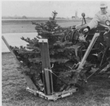
TS-20: Ball diameter, 20 in.; Ball diameter, 18 in.; Maximum tree diameter, 2 in. tree trunk (approx.) Ball weight, 109 lbs. (approx.) Tractor-mounted unit, or in combination with Vermeer F-218 Trencher.