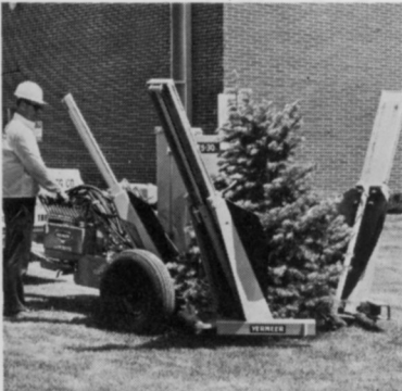
TS-30: Ball diameter, 30 in.; Ball depth, 26 in.; Maximum tree diameter, 3 in. tree trunk (approx.) Ball weight, 355 lbs. (approx.) Trailer or tractor-mounted units. Flat-bottom tree spade option.