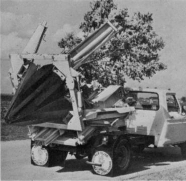
TS-44T: Ball diameter, 44 in.; Ball depth, 40 in.; Maximum tree diameter, 4 in. tree trunk (approx.) Ball weight, 1173 lbs. (approx.) Available as truck-mounted trailer-mounted or Vermeer M-485 tractor mounted unit.