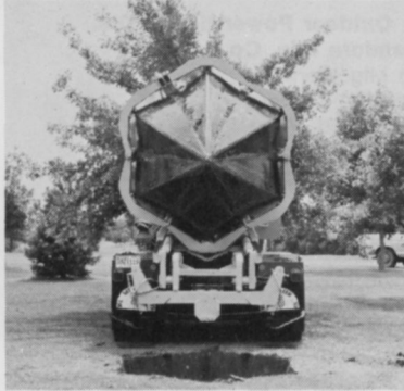
TS-84: Ball diameter, 84 in.; Ball depth, 54 in.; Maximum tree diameter, 8 in. tree trunk (approx.) Ball weight, 8,000 lbs. (approx.) Available as a truck-mounted unit only.