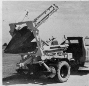
NEW! TS-44M . . . far greater maneuverability than ever before. No more guesswork. The TS-44M hydraulically extends (up to 21 in.) and shifts (up to 15½ in. left and right of center). It's fast, accurate. Cuts set-up time.