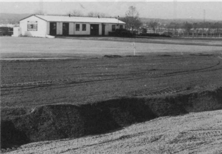
After turf experiments are completed, the top six inches of soil are removed, reconditioned and then replaced. During reconditioning the soil is shredded and screened.

"We recently reconditioned about half our bentgrass research area," says Duich. "The soil