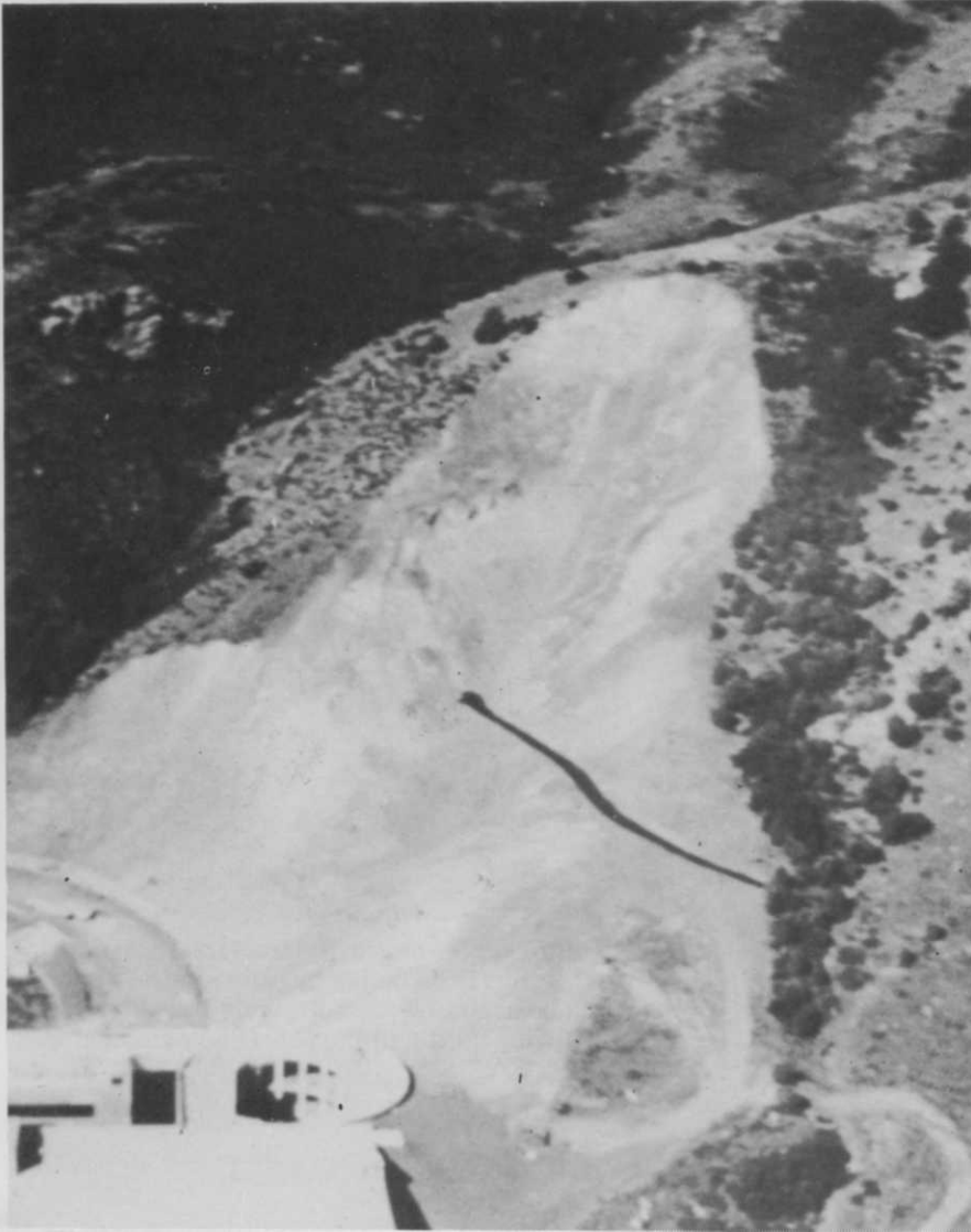
Scar left by landslide prior to revegetation.