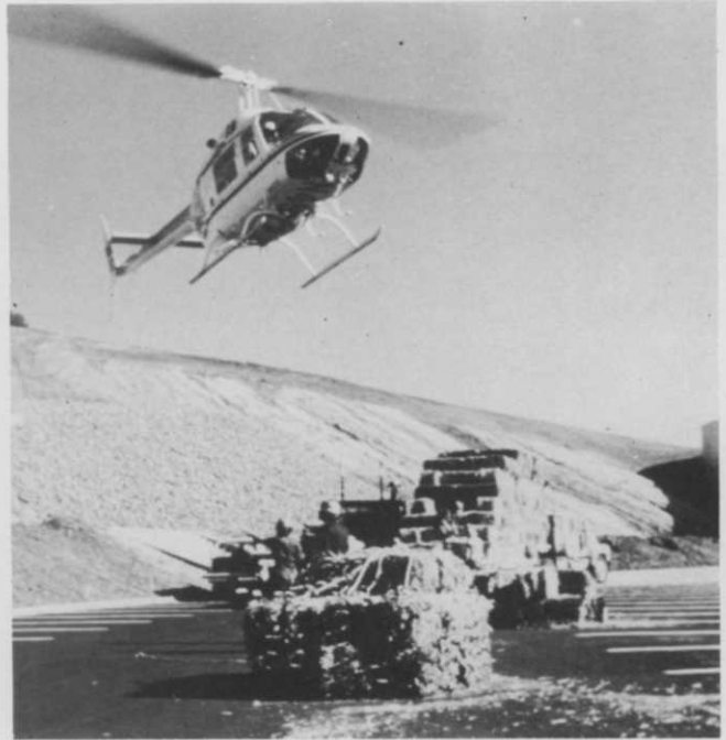
A helicopter delivered all supplies to men on the project in four hours flight time.