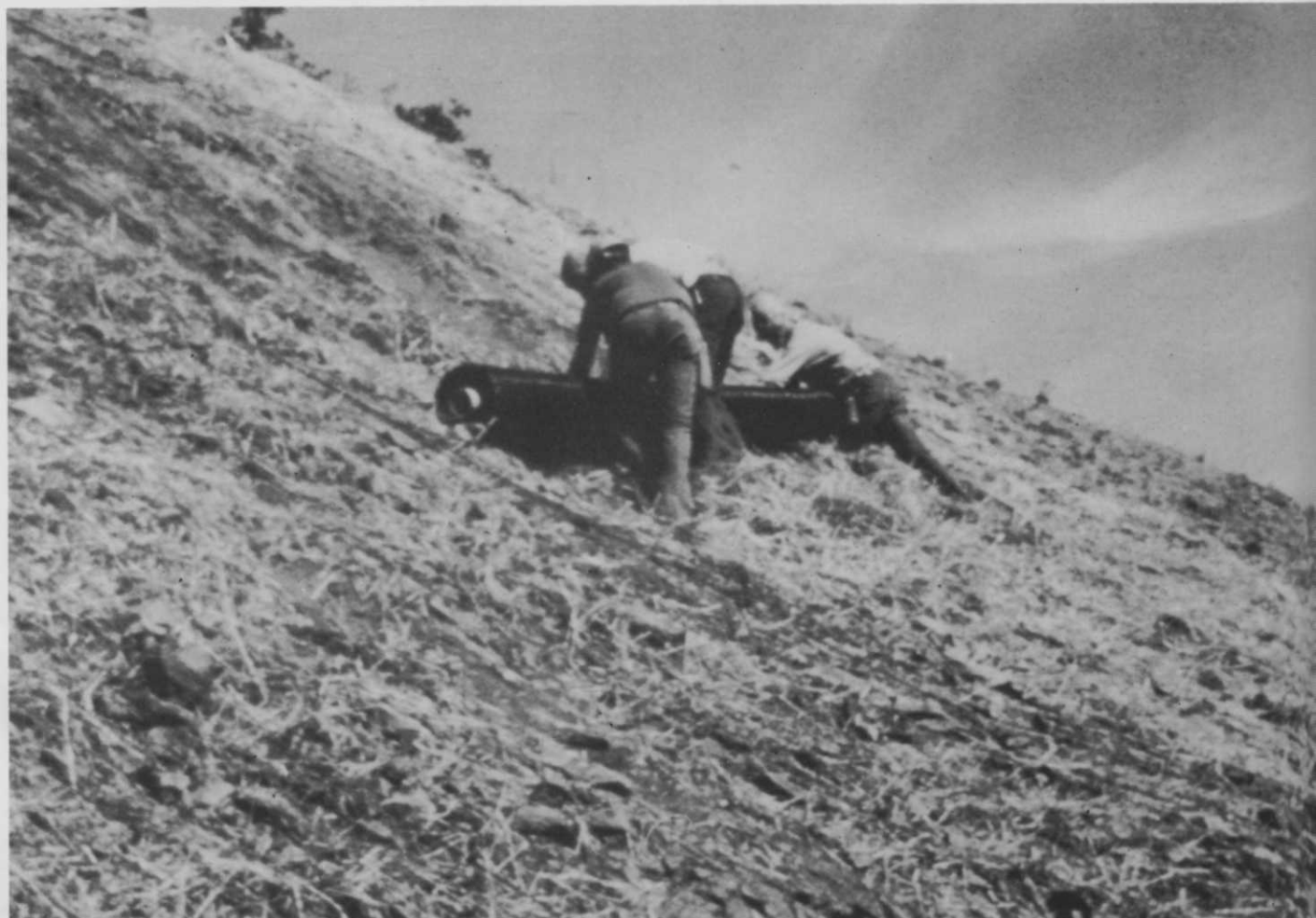
Workmen roll out netting by hand so as not to disturb the relatively loose soil structure of the canyon wall.

To achieve this concept in design the two primary elements must stand alone without visual interference from lesser features in the landscape. One such feature interfering with this concept was