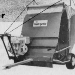
36", 60", 72" cutting widths with or without loading hopper.

thatches lawns, verti-cuts greens, tees and fairways, sweeps leaves, wades through high weeds and empties easily from the tractor. It's the pick-up mower that cleans, mows and sweeps.