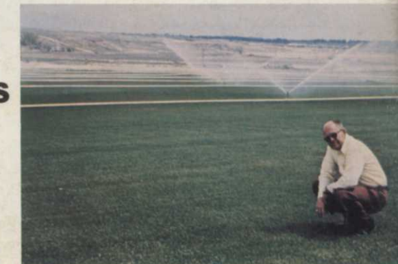
"In our climate of cool nights, warm days, high winds and low humidity, we need a grass that can survive long hauls, and stay green, fresh and beautiful."

"We've been growing Baron both in our mixtures and pure stands. We're impressed with Baron's rapid establishment, rugged durability and beautiful final appearance on customers' lawns. And Baron holds its color—even with neglect."