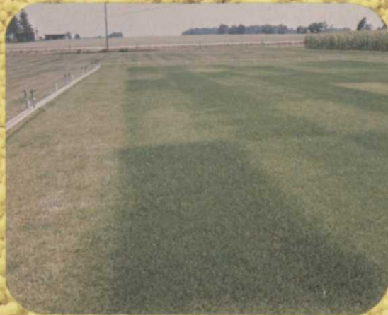
1975 research plots at the University of Guelph, Canada, where Sulphur Coated Urea was tested against other nitrogen fertilizers, including two commonly recognized as slow release nitrogen fertilizers. CIL Sulphur Coated Urea treated grass in foreground.