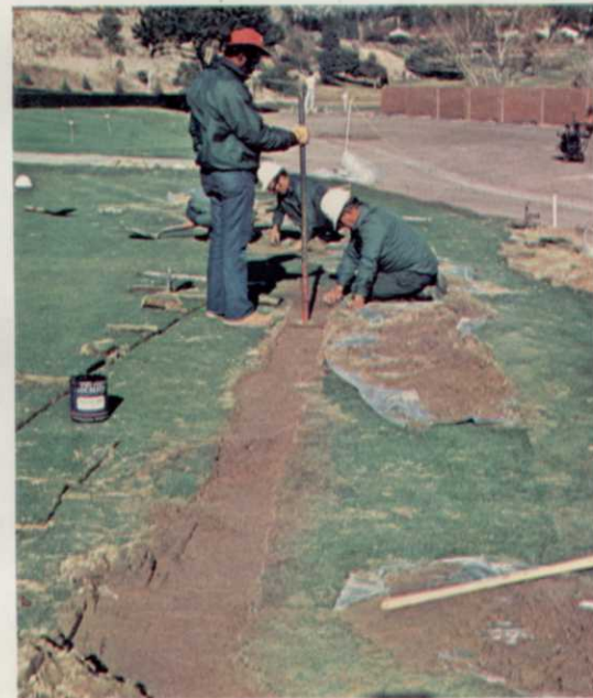
Top left, sod is removed. Top right, barrier, eight inches below surface is exposed. Lower left, plastic attached to original barrier is brought to surface. Lower right, sand is replaced and tamped for replacement of sod.