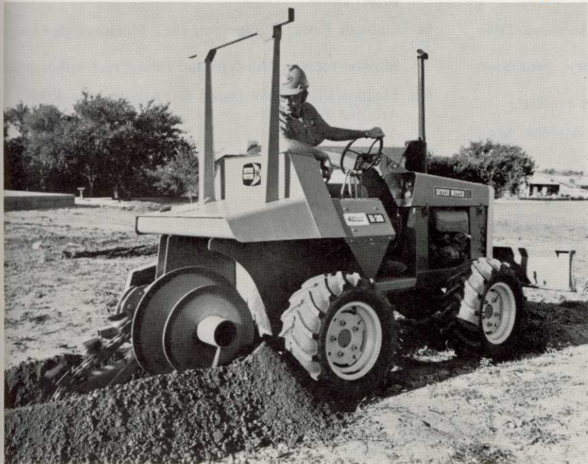
30-HP Model R30 — Trenching depths to 6' plus Modularmatic versatility