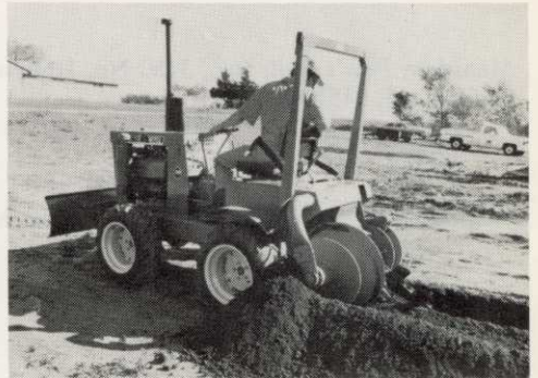
30-HP Model V30 — Trenching capabilities to 18" width, to 6' depth

Call (800) 654-6481 Toll Free for the name of the dealer nearest you.