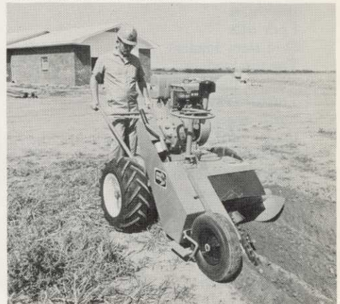
Handlebar Series — Two different models available from 7-HP to 12.5-HP

Ditch Witch . . . equipment from 7 - to 195-HP.