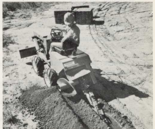
18-HP Model J20 — 4 wheel drive, with three speed forward plus reverse transmission