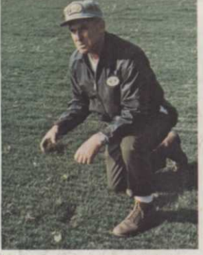
"I look for a grass that is as disease-resistant as I can find. I couldn't find a patch of rust or dollar spot. Looks like it resists other diseases too."