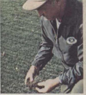
"Probably the thing I like best about Baron is the way it comes up fast. I can plant Baron late in the season and still harvest sooner."

"Some grasses just don't take to the shock of mowing. Baron has what I call 'mowability qualities.' It withstands short mowing and the dark green color doesn't fade."