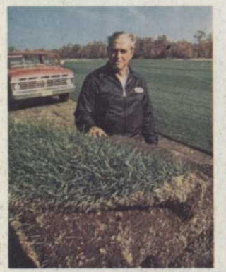
"I have compared Baron to Merion and found that Baron requires less fertilizer and was less sensitive to a dry spell just after planting. Let's face it. . . less water and less fertilizer means more money for me."

baron KENTUCKY BLUEGRASS U.S. Dwarf Variety Plant Patent No. 3186