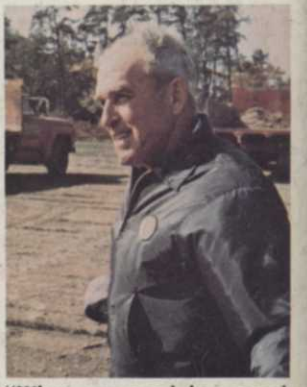
"What we need is a good tight root system that holds together from the field to the job. Baron lets us be a little less fussy when we're loading. It's tough."