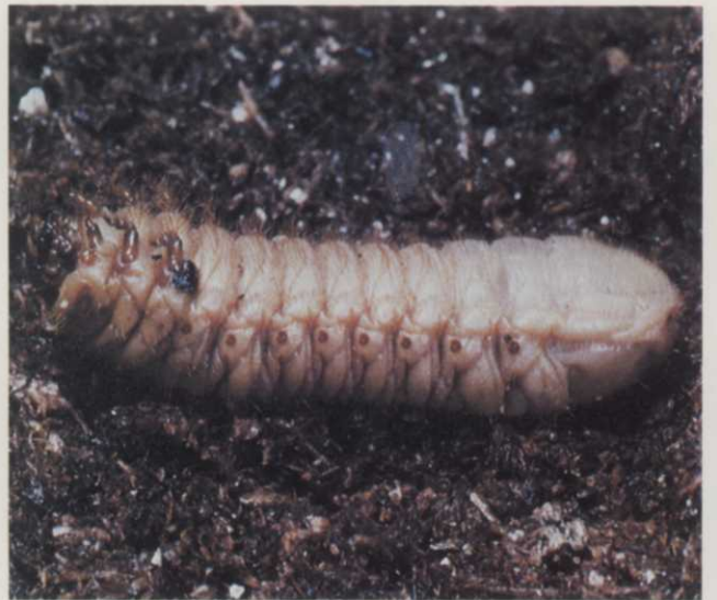
Green June beetle