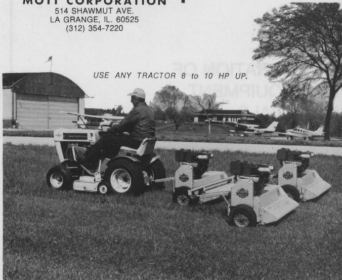
USE ANY TRACTOR 8 to 10 HP UP.