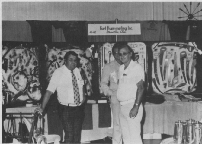
Convention — 1975